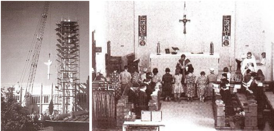
Above, left The erection of the monument.