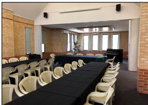
Wedding / Special events