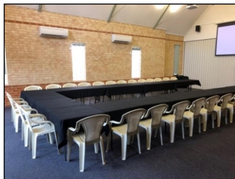
Classroom style: seating 24 persons (max)