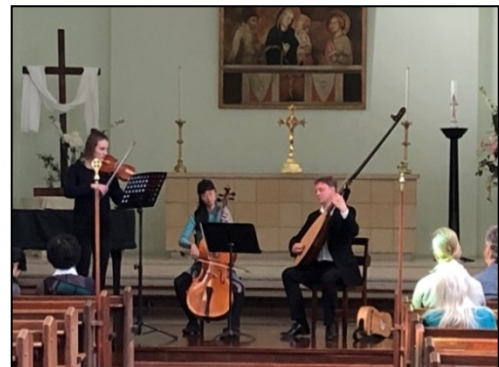
Australian Baroque Masterclass