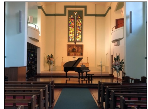
Yamaha C5 Grand