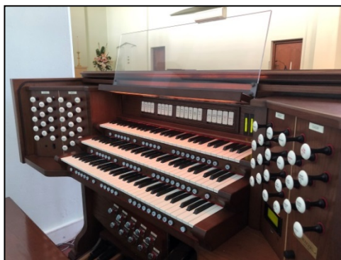
Rodgers Organ – 3 manual