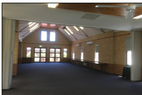
Combined Hall & Meeting Room