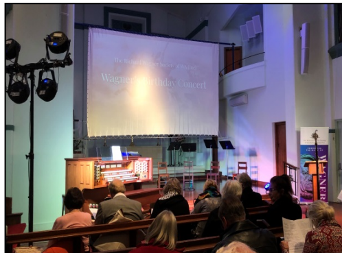
The Wagner Society of WA concert