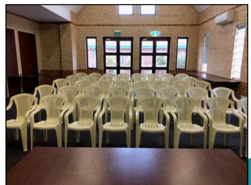
Business meeting or Conference: seating 60 persons (max)